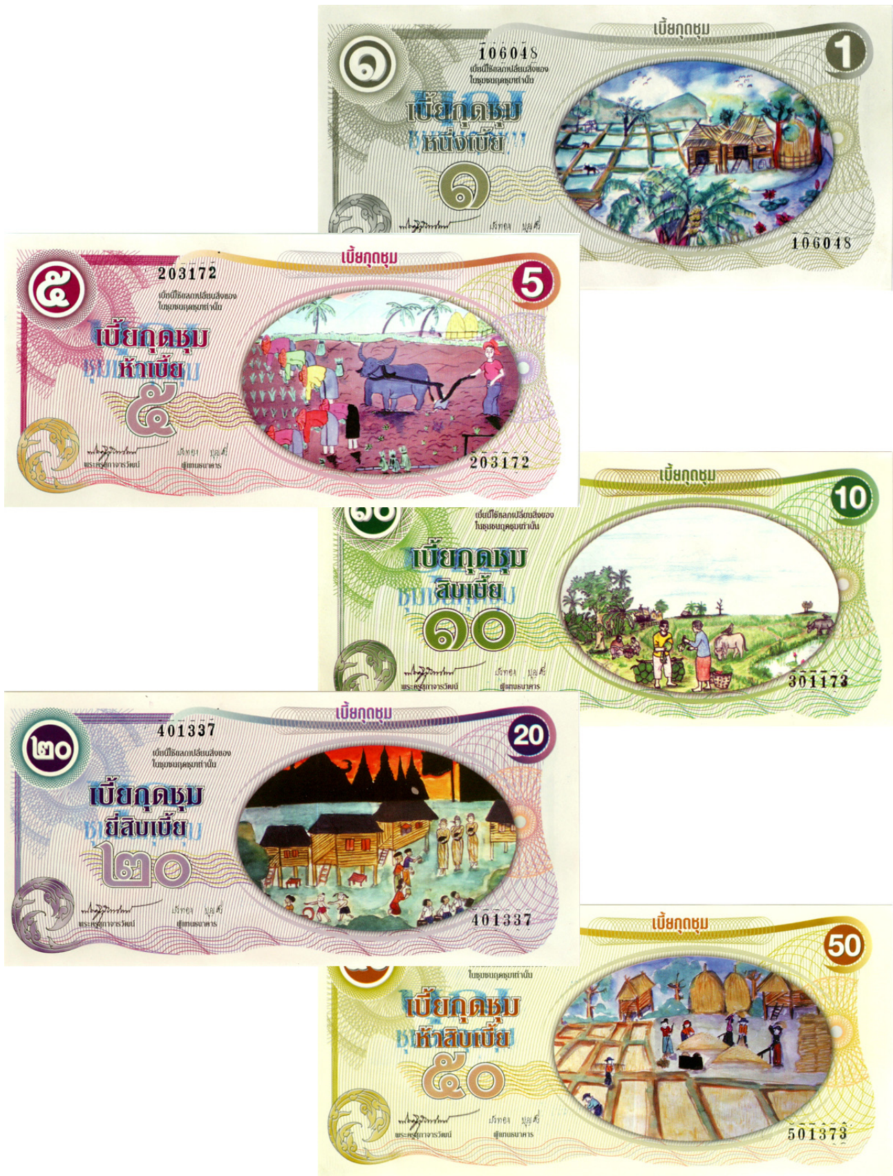
Figure 2: The Bia Kut Chum Community Currency Notes