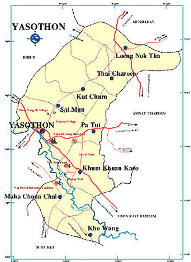
Map 1: Study Area: Kut Chum District, Yasothon

Livelihoods during the first half of the 20 th century were modest but self-sufficient, and centred mainly on subsistence farming. In all three villages the sur-